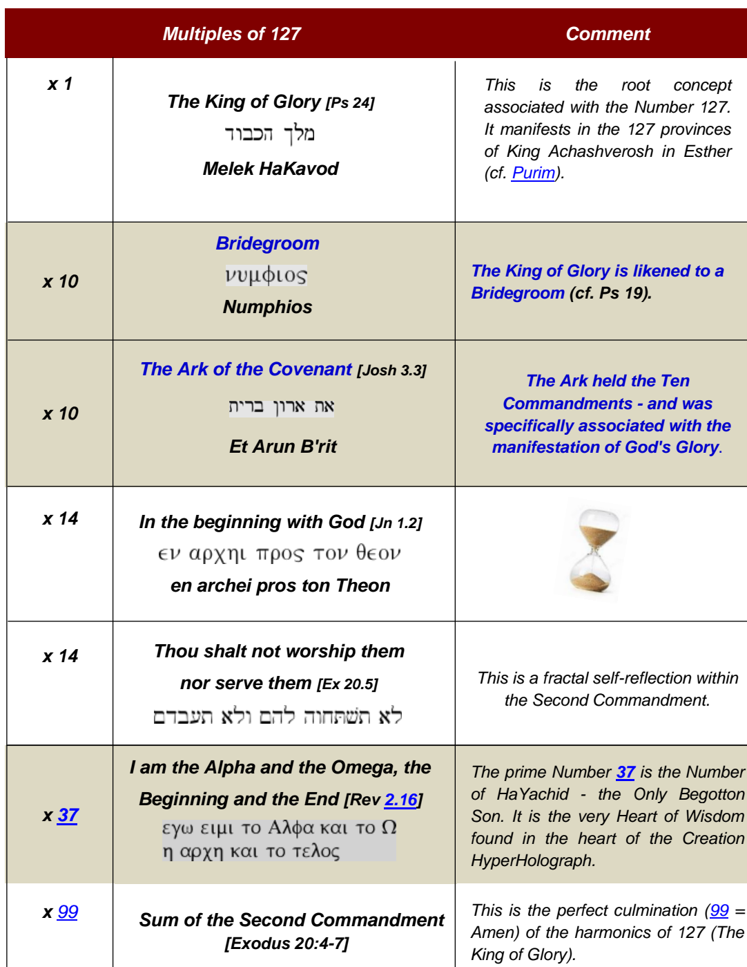
127 Table sourced from the Bible Wheel

From Spanish Inquisition - New America during Tetrad 1492 to last year 2015 are 523 years 523 = Alphabet / Aleph and Tav, Chariot of Fire, Resurrection